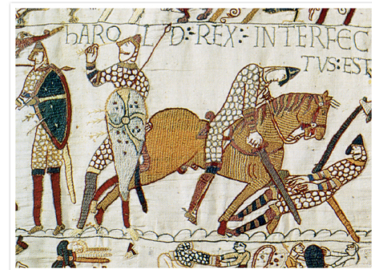
Part of the Bayeux Tapestry showing the death of King Harold II

The Bayeux Tapestry tells the story of the Norman invasion and the Battle of Hastings in 50 different scenes. It is an embroidered cloth over 70m long and 50cm wide. The tapestry shows Duke William of Normandy sailing across the English Channel with his army and horses, the Battle of Hastings and the death of King Harold II. The tapestry is on display in the Bayeux Museum in northern France.