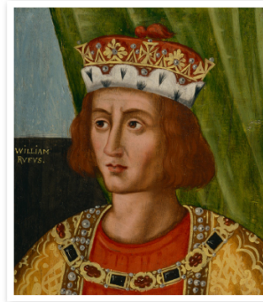
William Rufus (c.1056–1100)

William the Conqueror died on 9th September 1087 while fighting in France. He had decided to make his second son, William Rufus, the next King of England instead of his oldest son, Robert. Robert and his friends were not happy about the situation because they thought Robert should be king. Robert's followers led two rebellions against William Rufus over the next eight years and they were defeated both times. William Rufus died in a hunting accident in 1100 and his younger brother, Henry, became King of England.