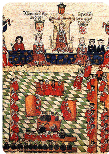
Edward I and the Model Parliament

The power of the monarchy has changed over time. In the past, some monarchs had absolute power. This meant that they could do whatever they wanted. Today, there is a constitutional monarchy. This means that the monarch is controlled by parliament and the government.