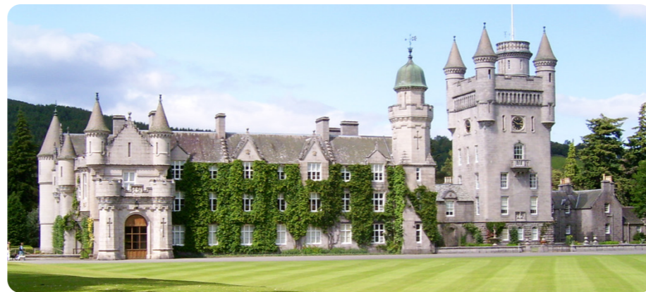
Balmoral Castle is in Aberdeenshire, Scotland.