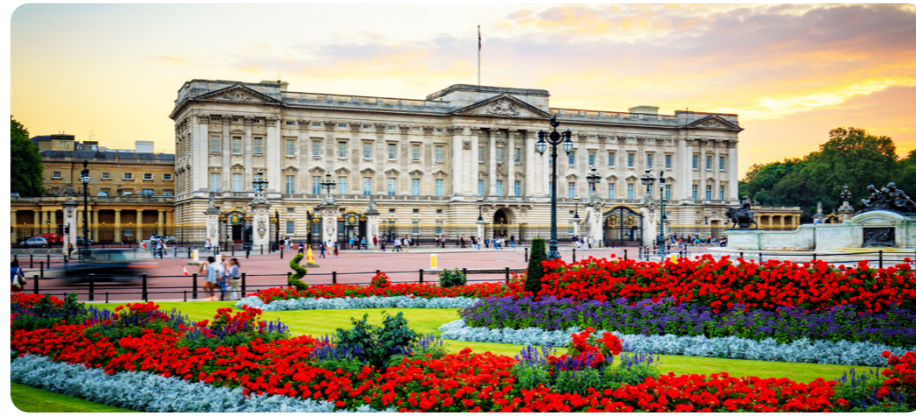
Buckingham Palace is in London, England.

Royal residences include palaces, castles and stately homes. Some of them are used for official royal business. Some are used as holiday or private homes. Many are tourist attractions.