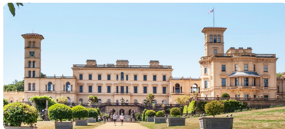
Osborne House is on the Isle of Wight, England.