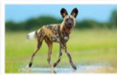
African wild dog

Animals can be sorted by whether they are wild or domestic. Different species of dog can be found in the wild and in the home as a domestic pet.