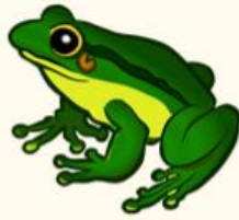
Year 4 Frogs