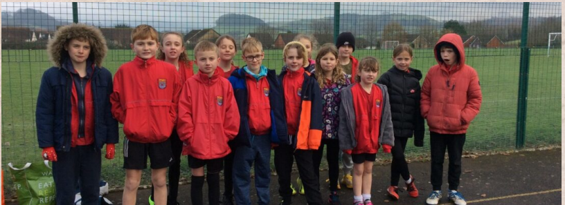
This half term's cross country team

A big well done to our Cross Country team too for their excellent efforts at the recent event.