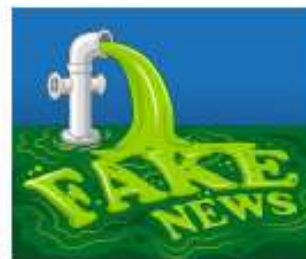
A Parent's Guide to Fake News