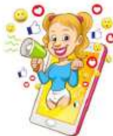
A Parent's Guide to Online Influencers