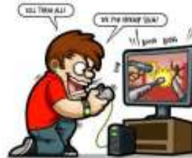
A Parent's Guide to Gaming