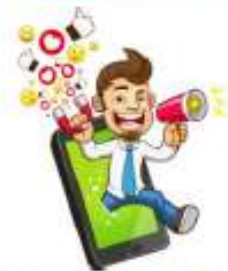
A Parent's Guide to Live Streaming