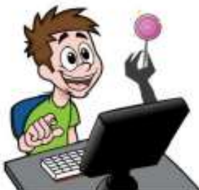
A Parent's Guide to Online Grooming