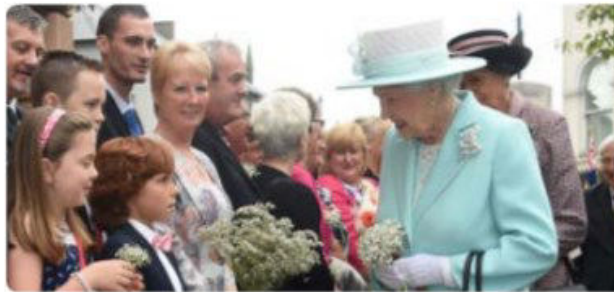
The Queen meets lots of people.

Elizabeth II is the Queen of the United Kingdom. She was born in 1926 and became queen in 1952. The Queen is married to Prince Philip and has a large family. She lives in Buckingham Palace in London. The Queen is very important. She visits charities and schools in the United Kingdom and welcomes world leaders to Buckingham Palace.