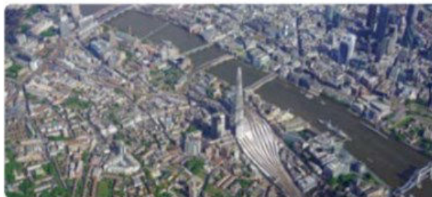
Aerial view of London

A city is a large, busy settlement where lots of people live and work. A city usually has a cathedral, a river, important buildings and offices where people work. There are lots of things to see and do in a city. There are many shops and restaurants to visit.